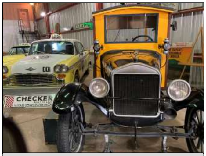
Checker cabs, from a Model T to a Ford Fairlane.