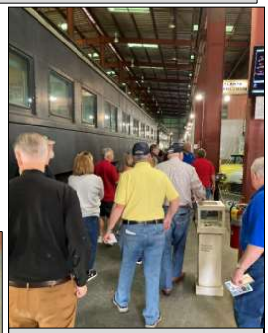
BIG building for those trains!