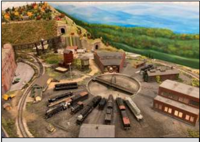
Model train display.