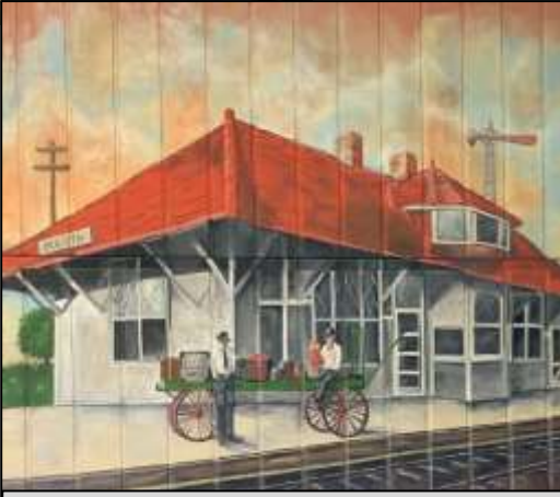
Duluth train depot of yesteryear.