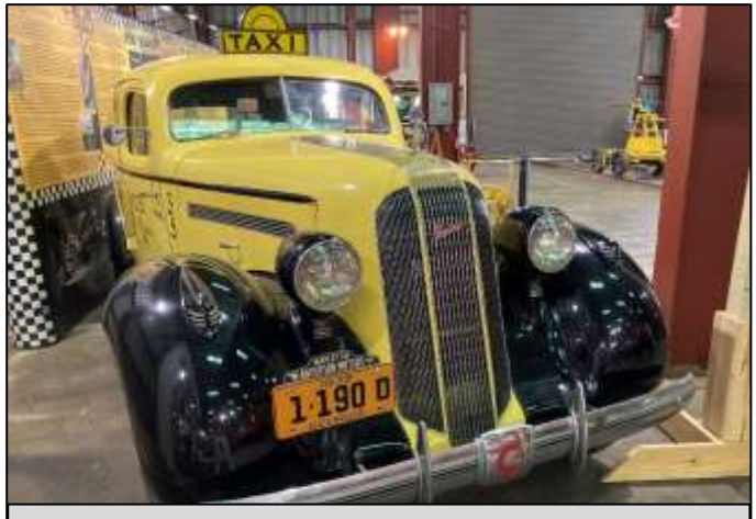
Another Checker Cab – a Pontiac