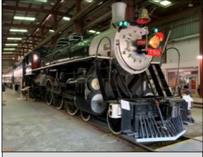
Steam engine #750

After our wonderful visit, we headed down the road to a nearby restaurant that was originally a Rexall Drugstore, complete with soda fountain counter. You can still get a sense of how it must have looked. And the food was tasty, too! Thanks to the Corleys for putting this day together for us.